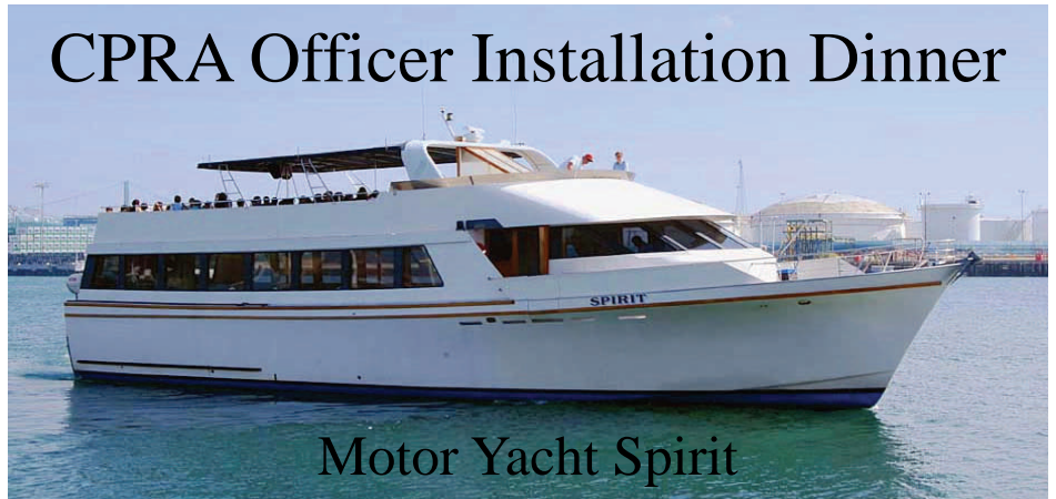
Motor Yacht Spirit

Join us on a 4 hour dinner cruise on board the 90' luxury yacht "Motor Yacht Spirit". The Yacht will be setup in Traditional Holiday Decorations