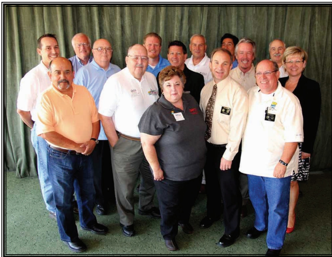
CPRA & NAPCO Board Members Bakersfield, May 17, 2012

Join us at the next CPRA monthly meeting on June 21st at Talley, in the city of Santa Fe Springs. All public safety communication technicians and equipment installers are invited to attend second round of the "Tech Talk" Round Table, that will take place during the Frequency Coordination session following lunch. See you then!!