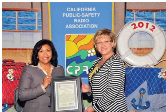
State Assembly member Norma Torres