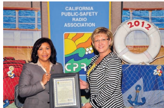
State Assembly member Norma Torres